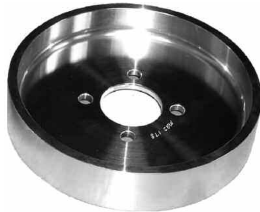
Pump Pulley #MAS178

Please visit us at www.BBKPERFORMANCE.com to view a fully photographed installation of this and the many other BBK products available to help maximize the performance potential of your vehicle.