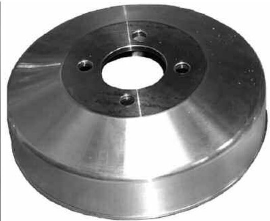
Pump Pulley #MAS176