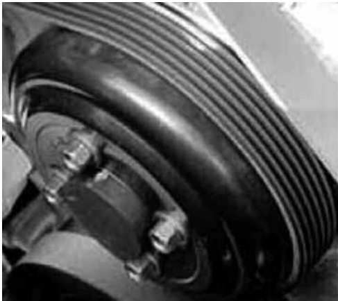
EARLY DESIGN – BBK1564

Refer to the pictures below to determine which pulley design you have. Since there is no definitive answer as to the time line or model years.