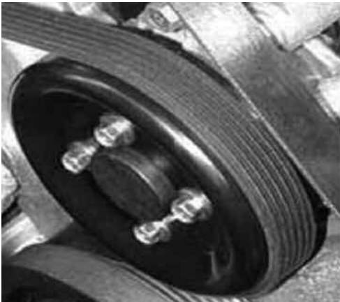
LATE DESIGN – BBK1608